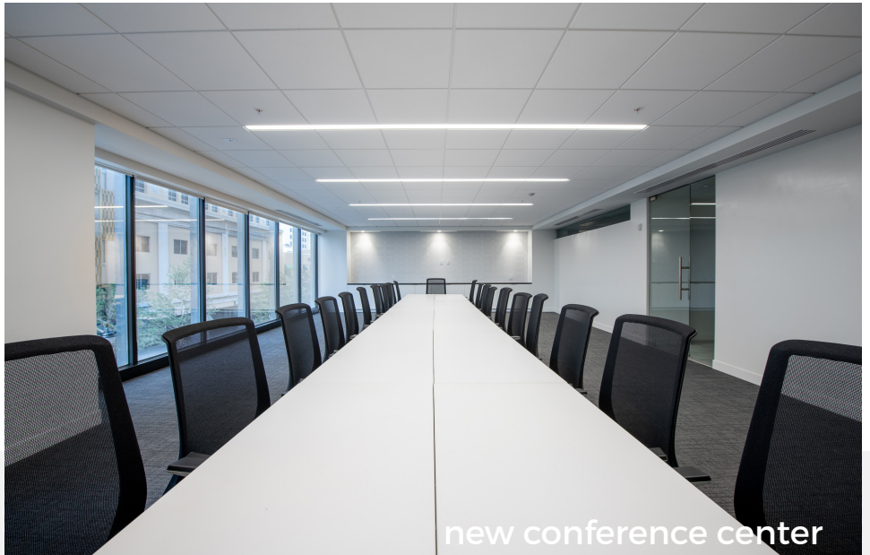
new conference center

The 2nd Floor amenities center offers state-of-the- art conferencing , classroom, and fitness facilities .