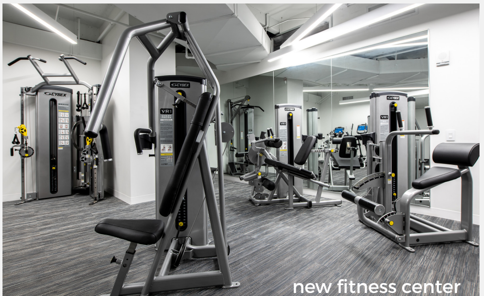
new fitness center

The 2nd Floor amenities center offers state-of-the- art conferencing , classroom, and fitness facilities .